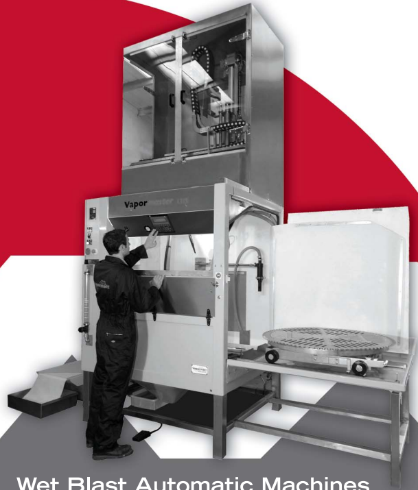
Wet Blast Automatic Machines