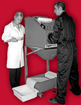
Wet Blast Hand Cabinets